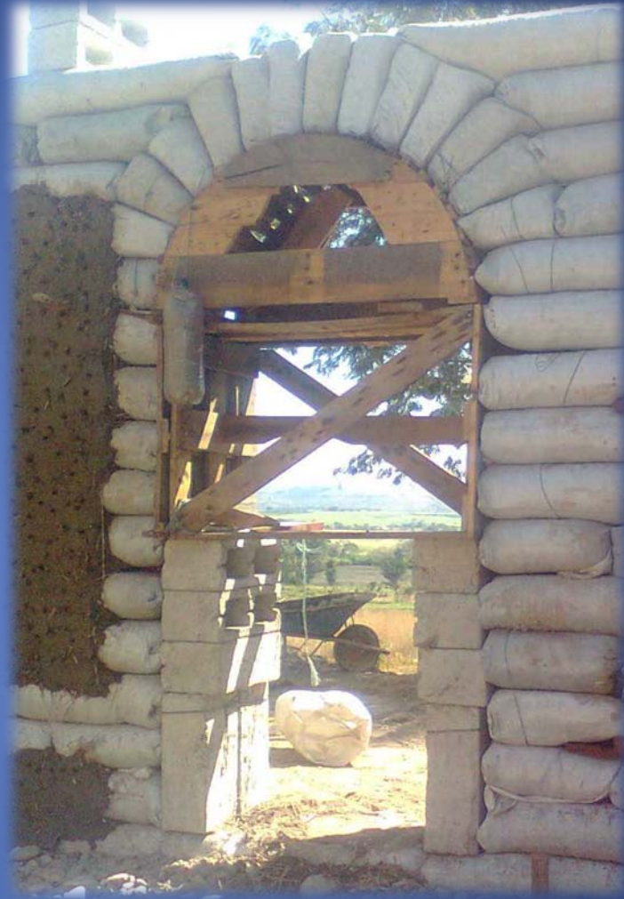
8. Have fun placing fan bags.