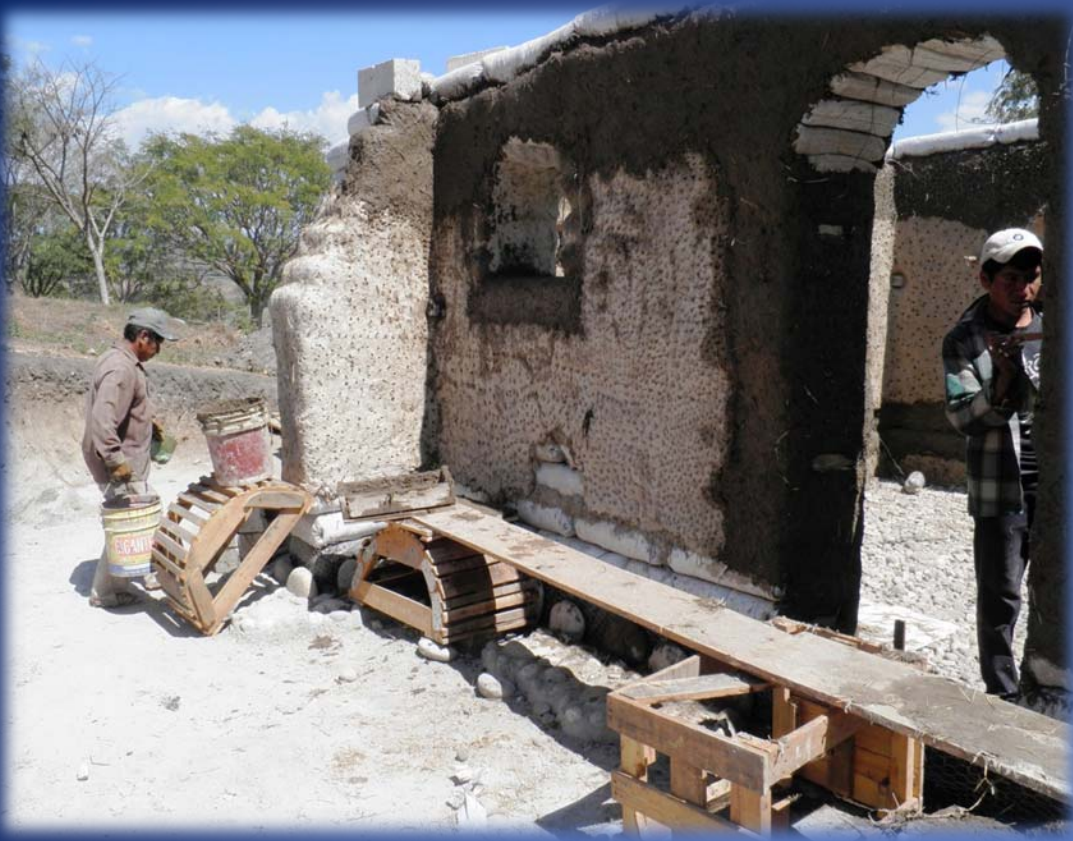
11. Forms as scaffoldings !!