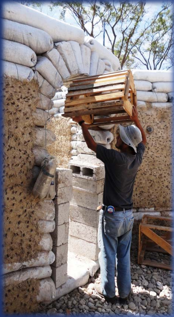
9. Remove the forms