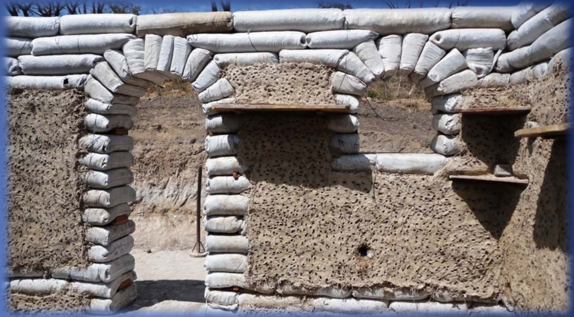
10. It was now easy to walk in or out !!