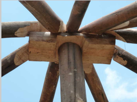
Roof center piece