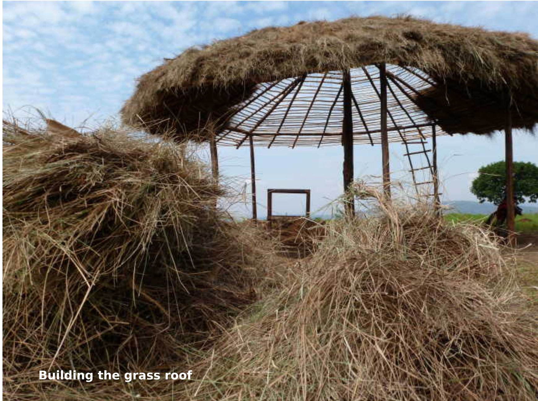
Building the grass roof