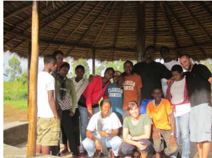
The Natural Building Team on the last day of work