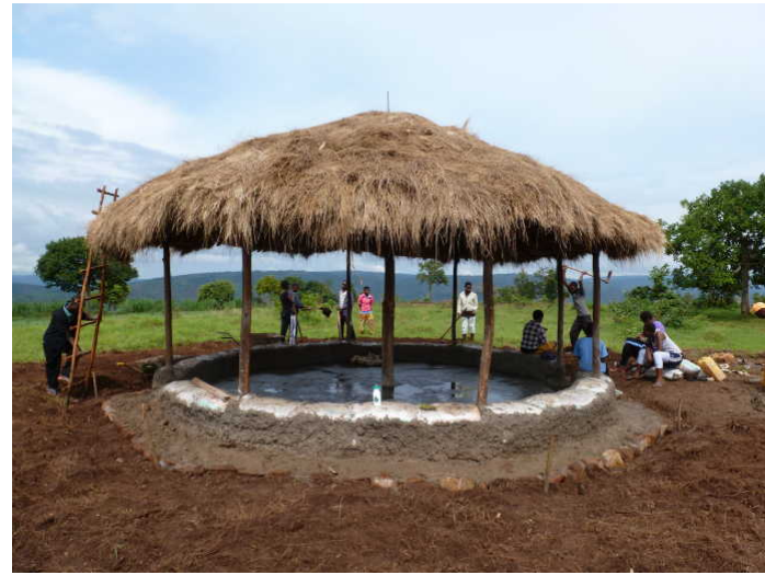
Cement on the exterior to protect the building