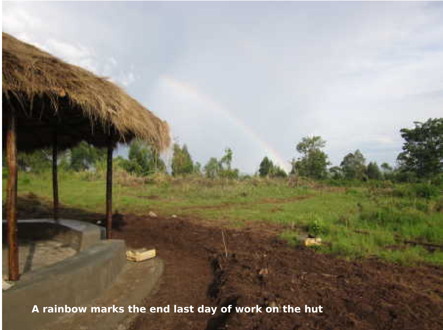
A rainbow marks the end last day of work on the hut