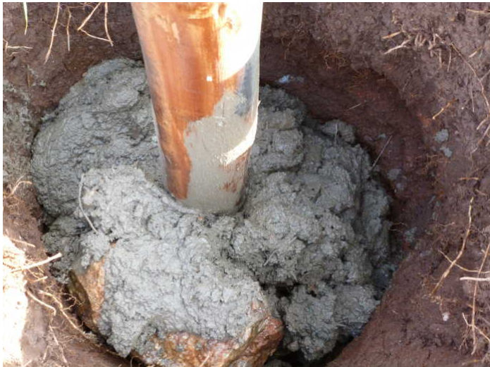
Pour the cement in the holes, layering stones and cement