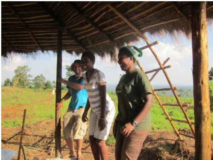
When the soil is compressed, it makes the wall more solid and strong