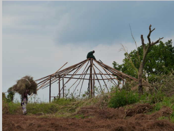
Poles 4m long, were placed from the roof center to the edge