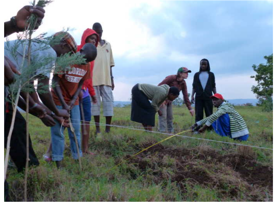
Taking measurements. The poles were marked for 3m from the center pole and 2.4m from each other.