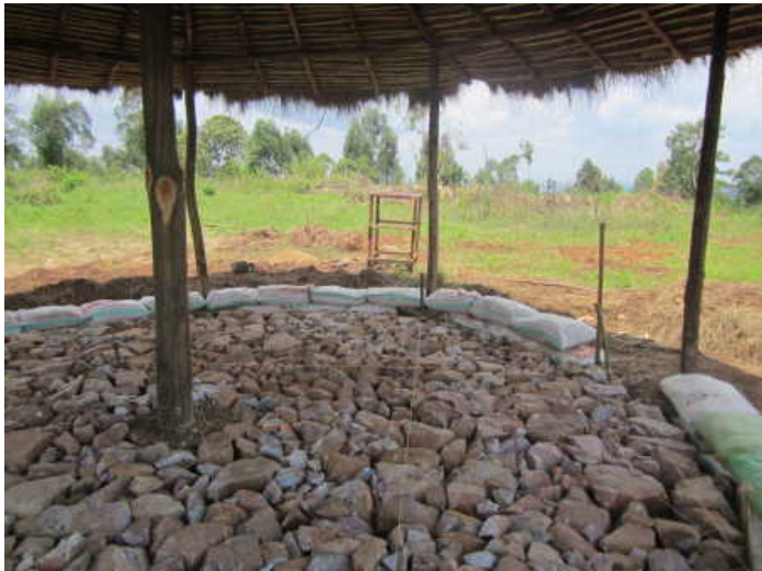
Second layer of bags