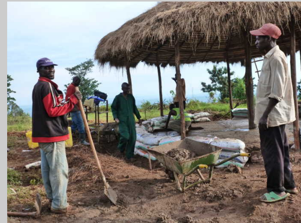
Many people make the work lighter