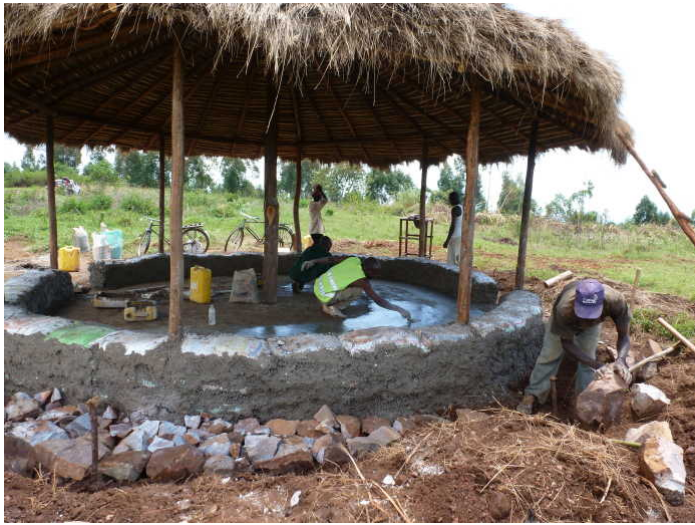
Finishing the cement inside, placing rocks on the outside