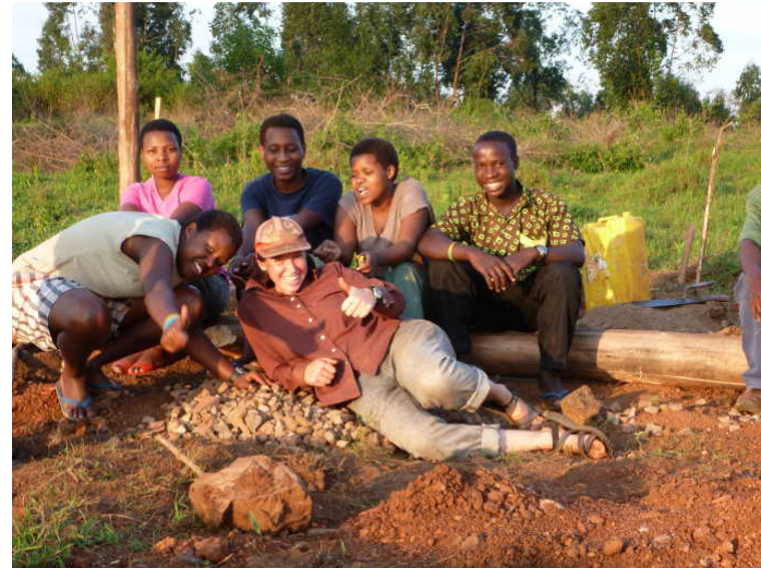
The building team after placing the first poles