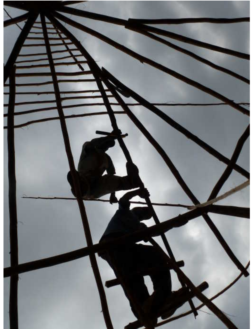
Building the roof