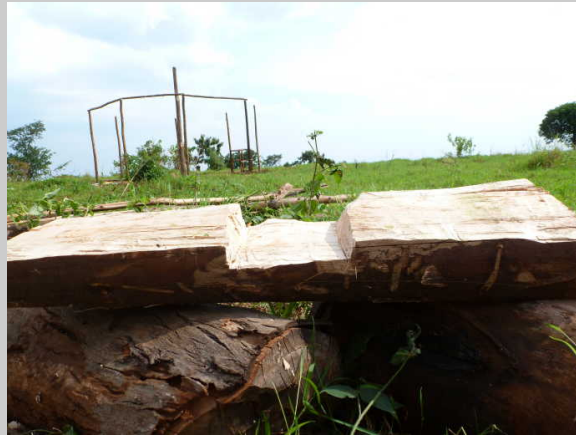
Roof center piece