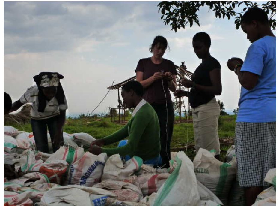
Then we sewed the bags shut using needles and string