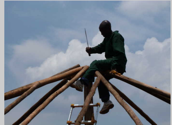
Building the roof