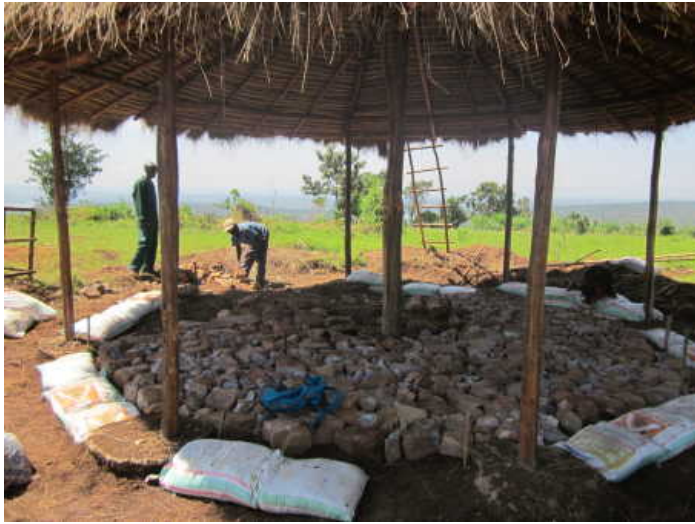
We placed the first layer of bags around the outside making sure to leave space for an entrance and exit