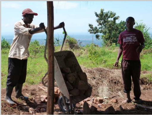
Bringing rocks to the work site