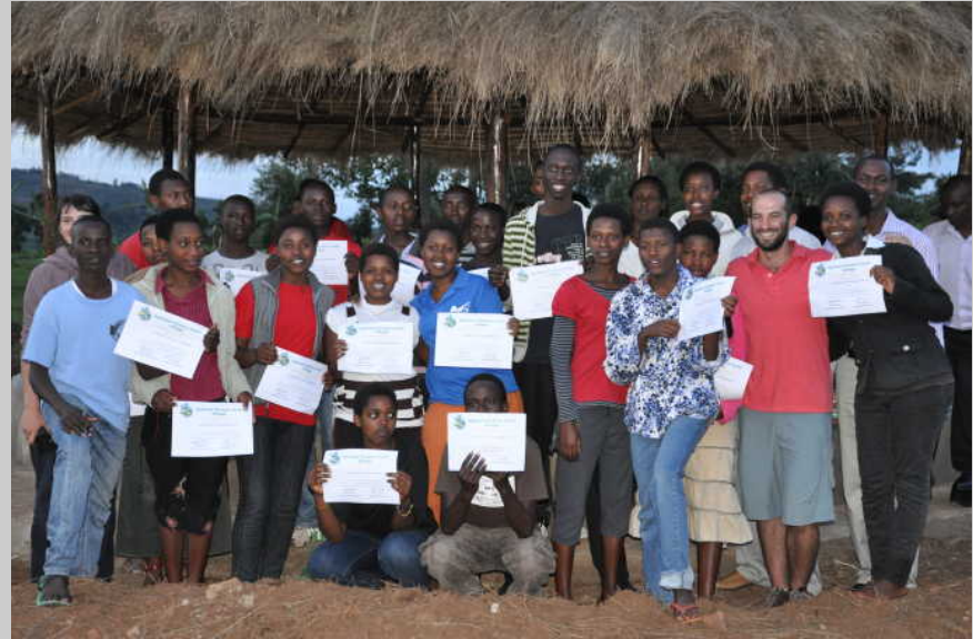
The Natural Building team with their certificates of achievement