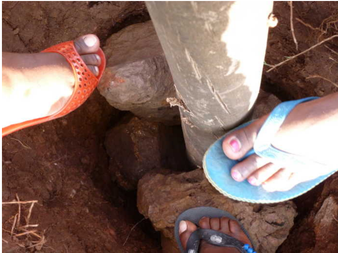
Use stones to hold the pole straight.