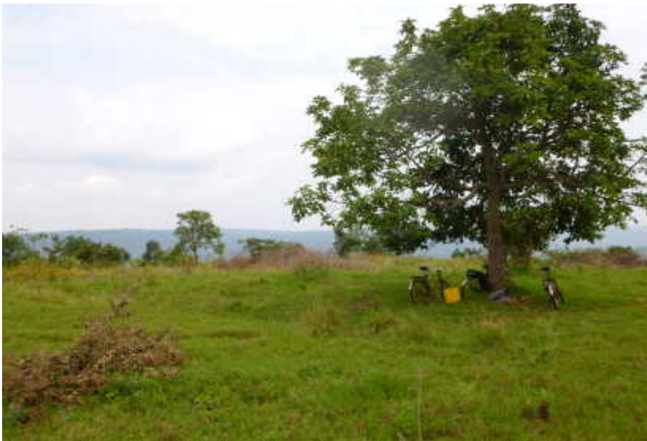
Open grassy area with great views of the surrounding areas

Choose a site where there is at least 30 m 2 of free space and is relatively flat. We wanted the site to be close to the Nature Park, but not necessarily inside the park because the Nature Park is small (1.7ha). We also didn't want to do too much to level the ground, or clear away bushes. We found the perfect spot 200m away from the park with amazing views of lake Mugesera.