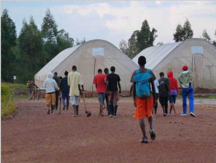
Building Team on the first day of work

We formed a Natural Building Team so students could learn how to make the hut and continue more in the future. The students were asked to write a letter of interest that showed they had motivation, good time management, could work in a team, were hard working, had willingness to learn and teach others. We also had help from the maintenance team of the village, six families and the environment club.