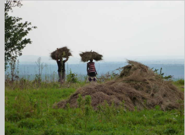
Carry the grass to the hut