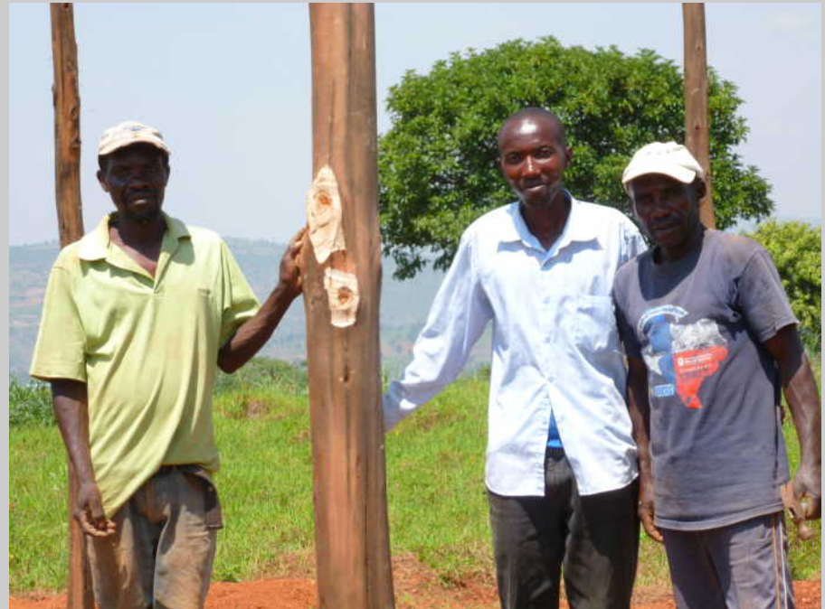
Our construction team