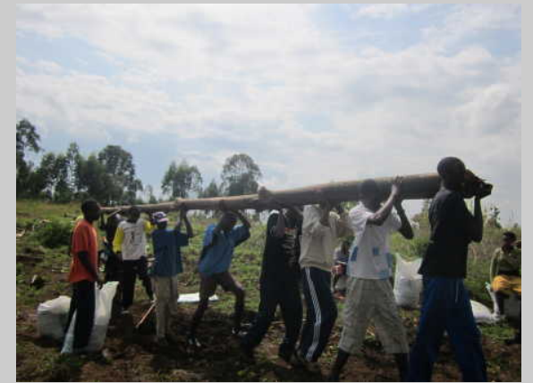
Carrying the big center pole