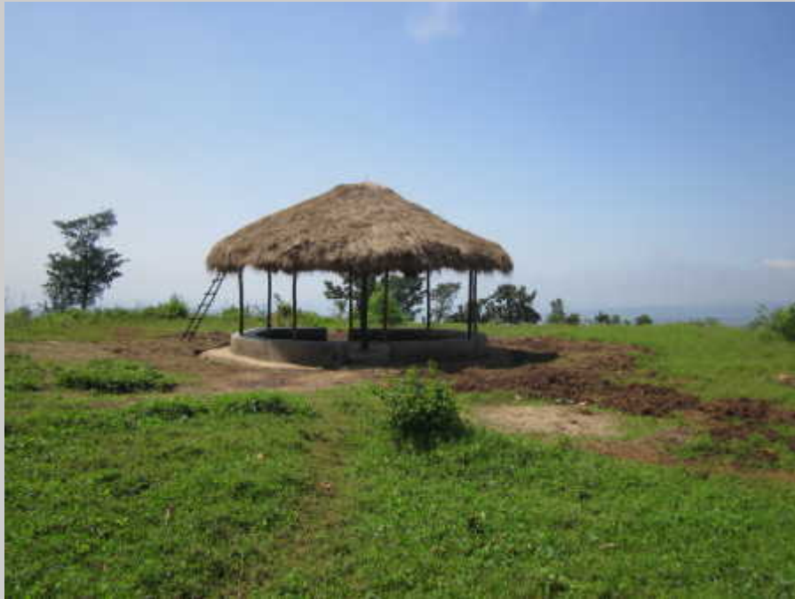
The finished hut