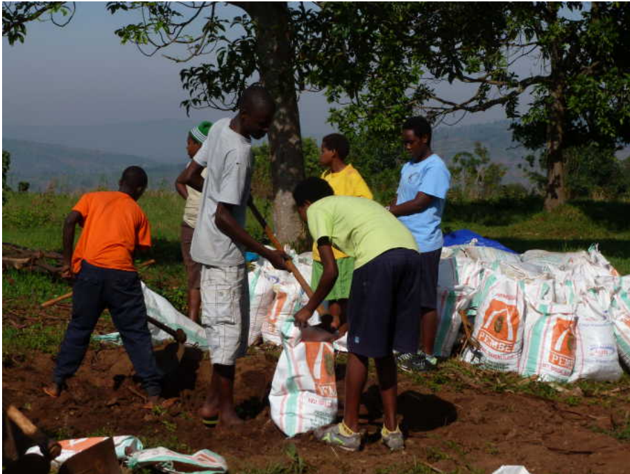
First we dug near to the building site and filled the bags with soil.

The benches were made using earthbag techniques. We took many of the specific techniques from a project at the Aman Setu school in Wagholi, India. They built an art center called the Kaleidoscope using earthbag and natural building techniques.