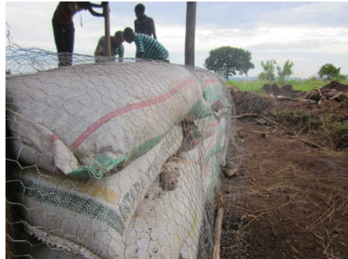
The chicken wire acts to reinforce the bench and make it easier to plaster with cement