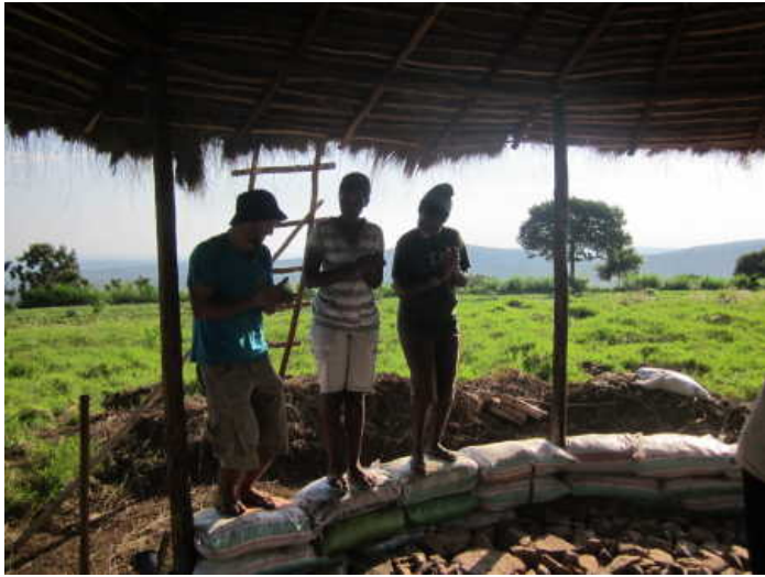
After placing each layer of bags we compressed them by jumping, dancing, and hitting them with a wooden log