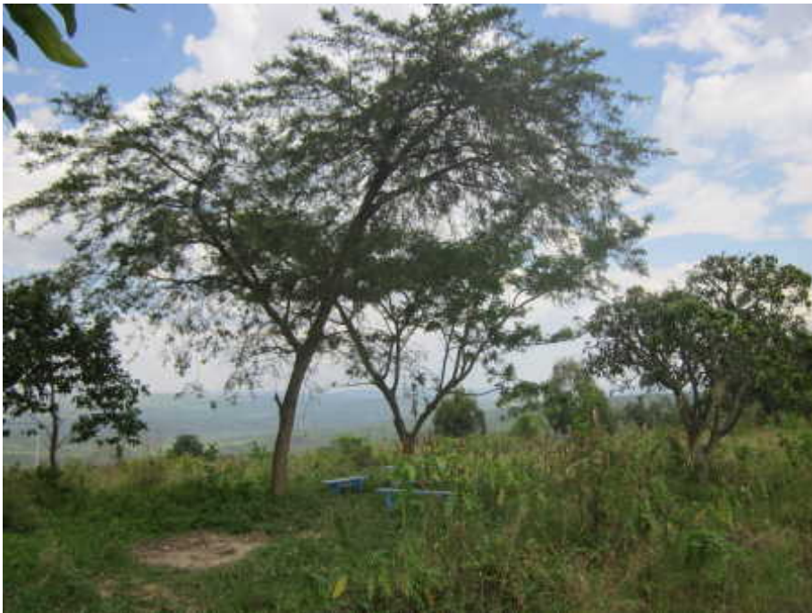
Sitting area in the ASYV Nature Park

This is to provide a background of the nature hut built at Agahozo-Shalom Youth Village during September-October 2012. We used a fusion of building techniques including: traditional Rwandan building techniques, wood frame construction and earth bag techniques. This document is also to provide instruction on how to continue a project like this in the future.