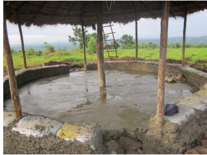
Cement plaster around the outside and inside of the benches