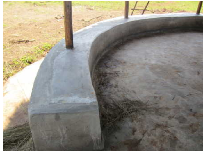
The benches were finished with a layer of smooth cement