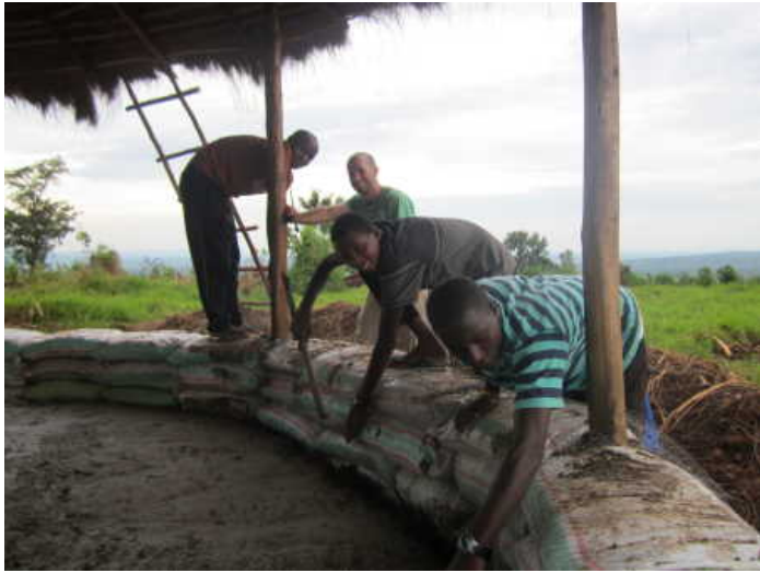
The chicken wire was tucked in and nailed to the bags