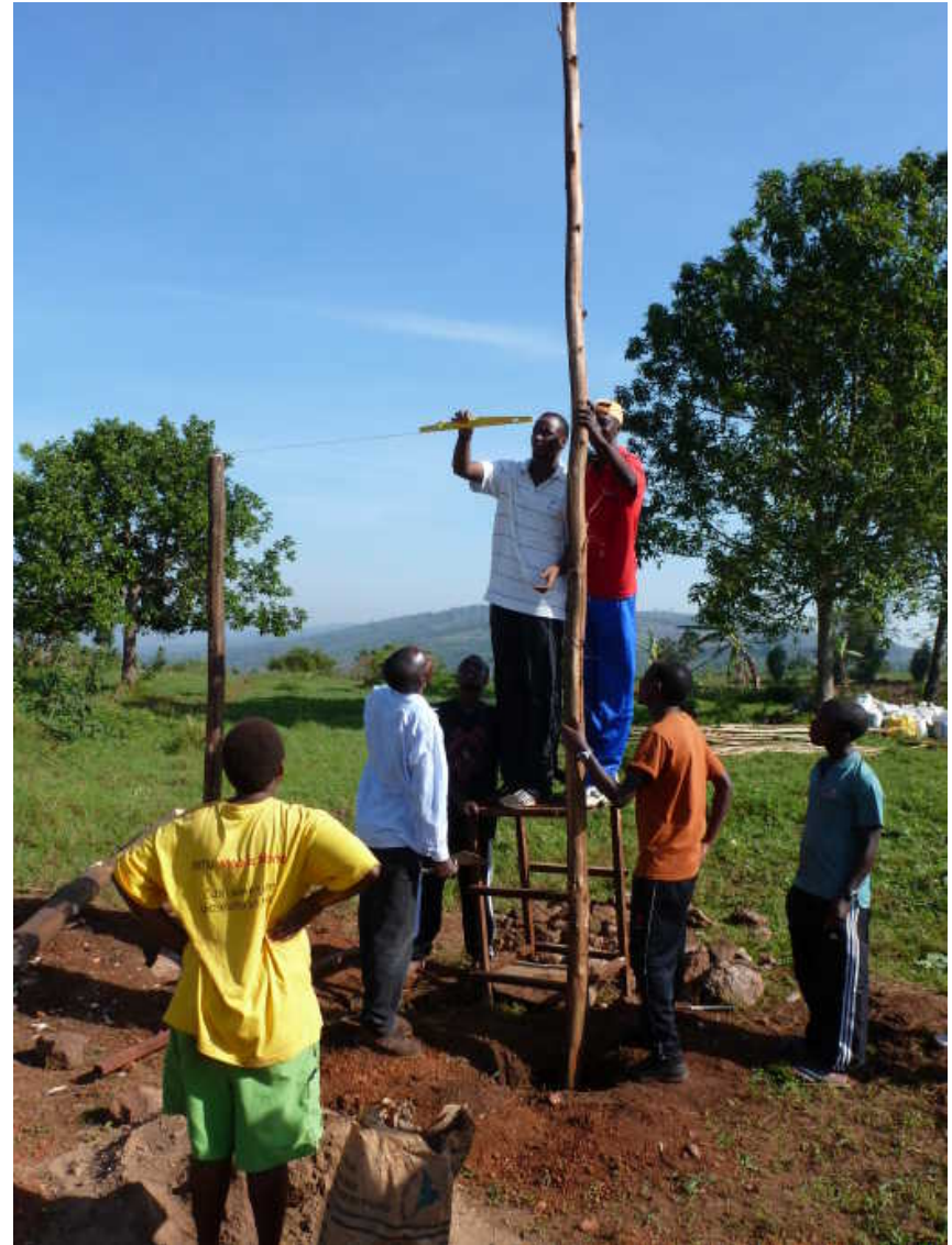
Once the main poles are cemented in, the rest of the roof and cross beams can be placed. A level and string can be used to make sure everything is together.