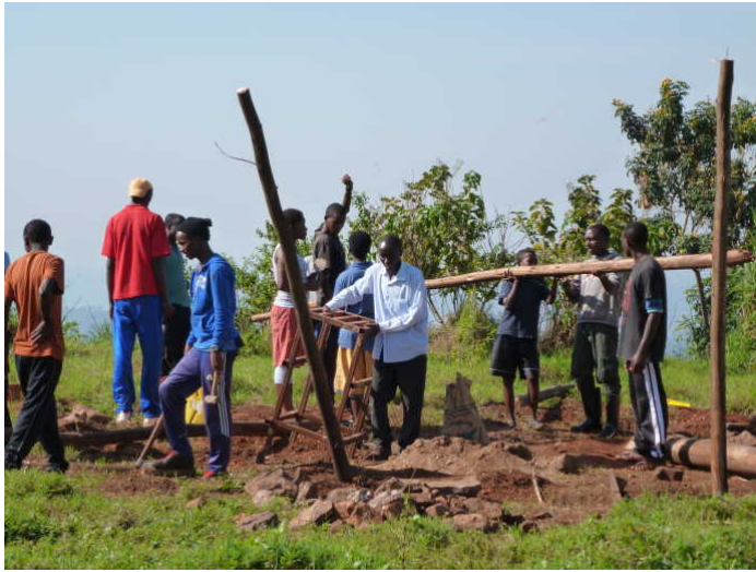
Team work to cement all the poles