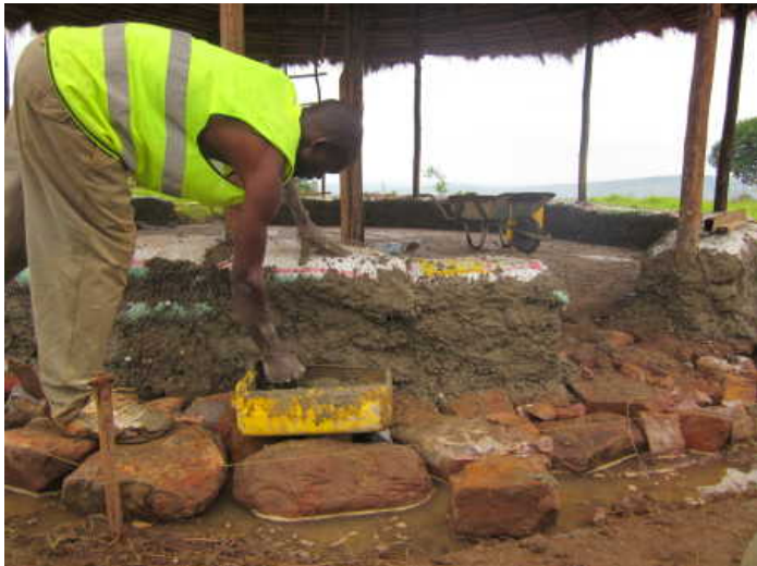
The benches were first plastered with a coarse layer of cement