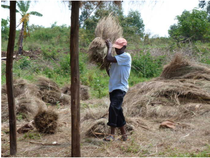
Bundle the grass and place on the roof