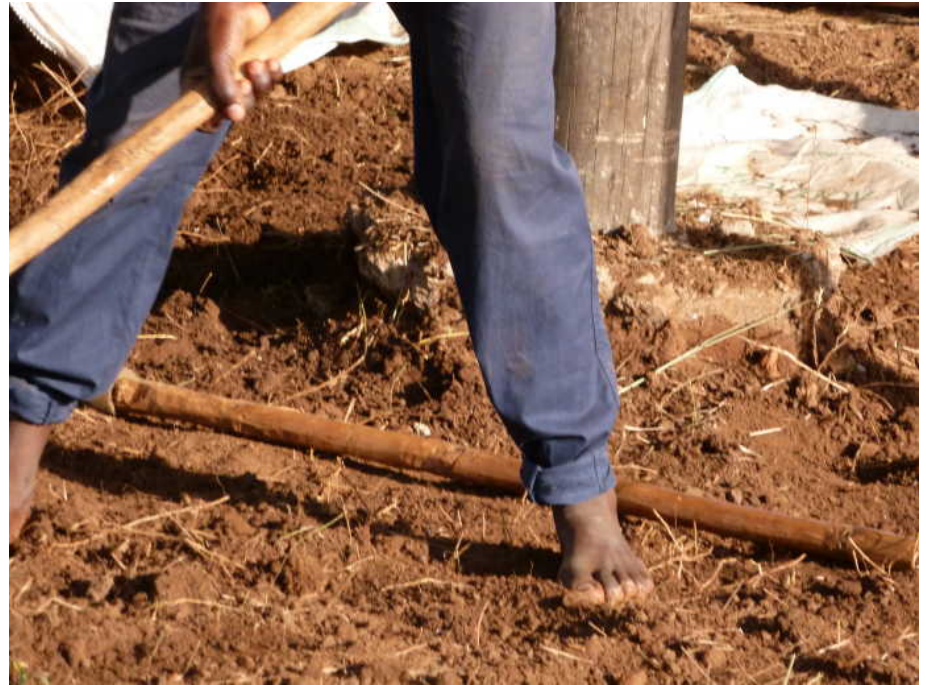
Preparing the floor of the hut