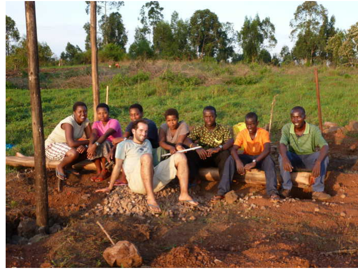
The building team after placing the first poles