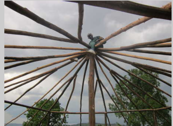
Triangle shape poles for support