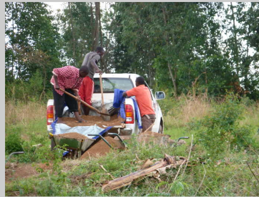
Bringing gravel to the work site