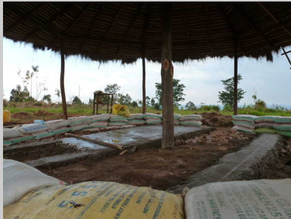
First few lines of level fine cement