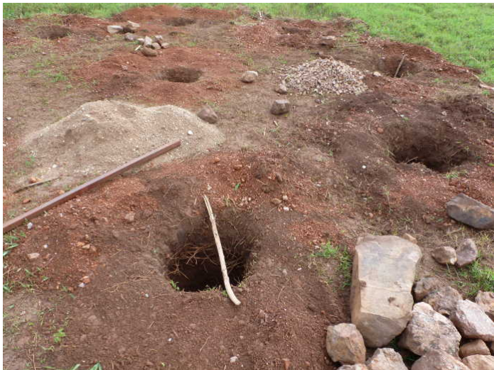
Dig holes between 80 cm to 1 m deep for each pole