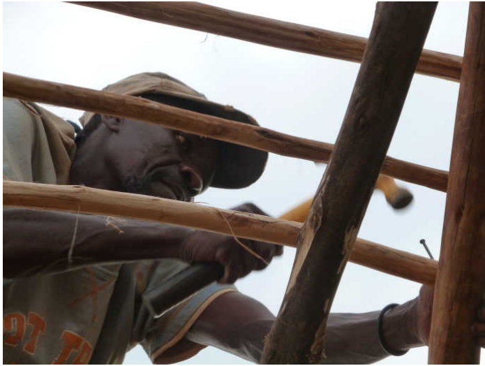
Small poles were placed perpendicular to the roof poles to support the grass