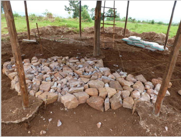
Place rocks using string and a level