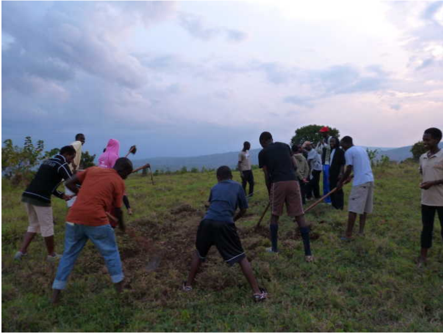
Clearing the hut area