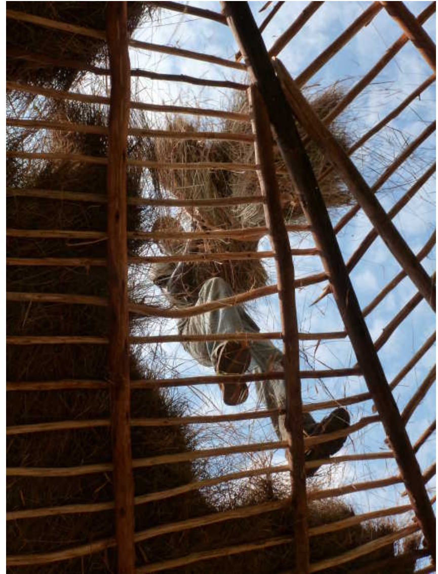
Layer the grass so it covers all parts of the roof