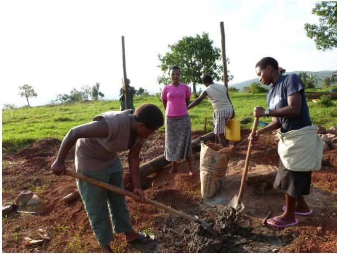
Mix the cement using sand, stones, cement and water