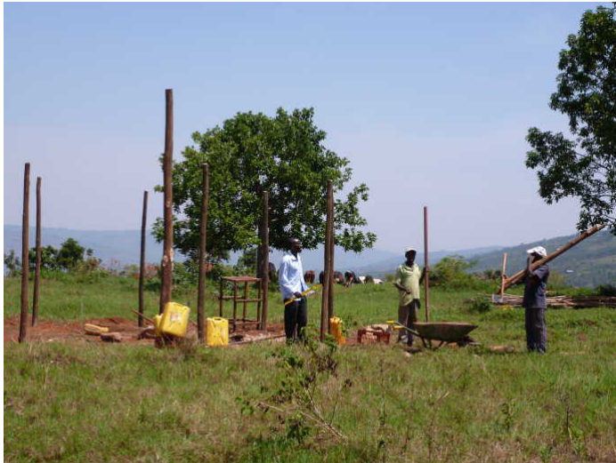
Nine poles were placed. The center pole was 3.6m above the ground. The eight other poles were all 2.4m above ground.