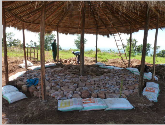
Building the floor