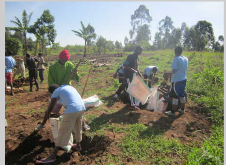
Soil was taken from the near the hut