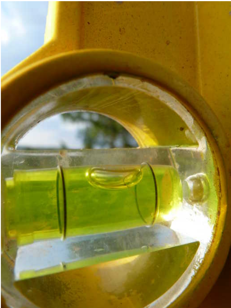
Use a level to check that the poles are straight.