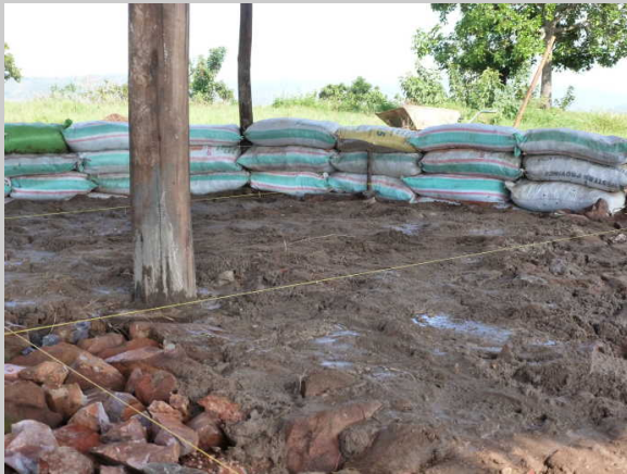
First layer of coarse cement