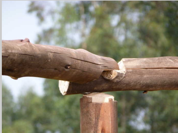
Connection of the main poles and roof cross beams