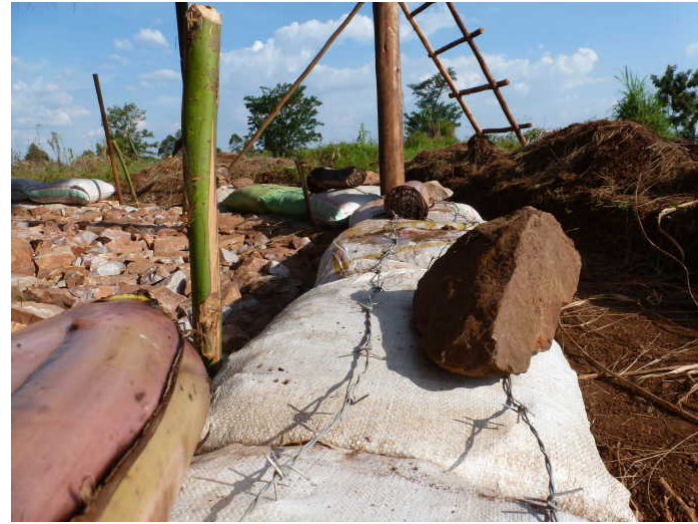
We placed two lines of barbed wire between the earthbag layers. This is to reinforce the benches to stop them from shifting.