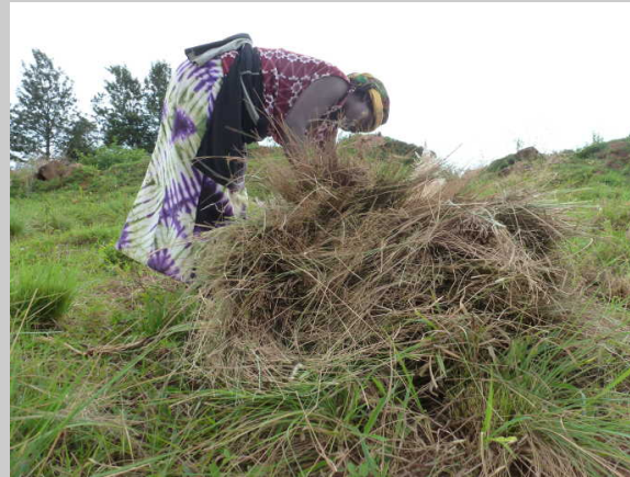
Gather the grass

The roof was created in the traditional way of a Rwandan house. Inshinge grass was cut from the area between the dining hall and school and carried to the hut location. Once enough grass was collected, small bundles were made and placed carefully on the roof structure. After 1-3 strong rains, more grass was placed on the roof. The rains help to compact the grass and show where more grass is needed.