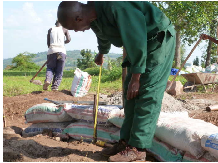
When the layer of bags were about 45 cm above the floor level, we covered them with chicken wire