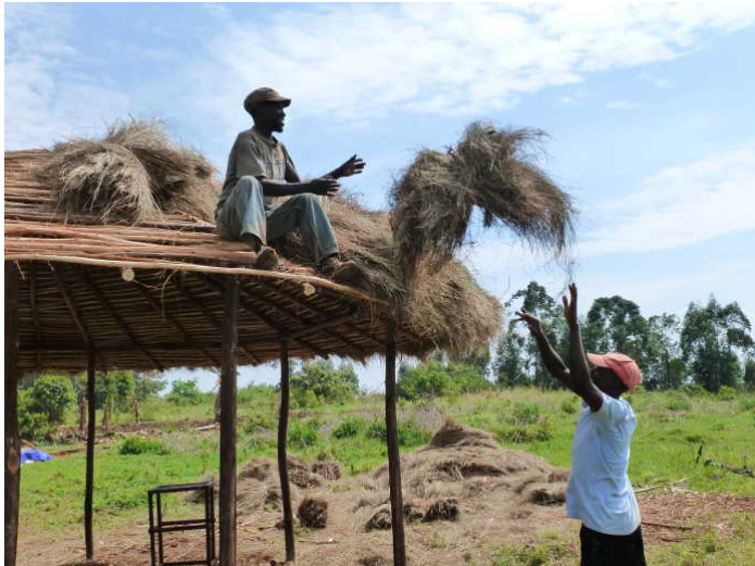
Placing bundles on roof