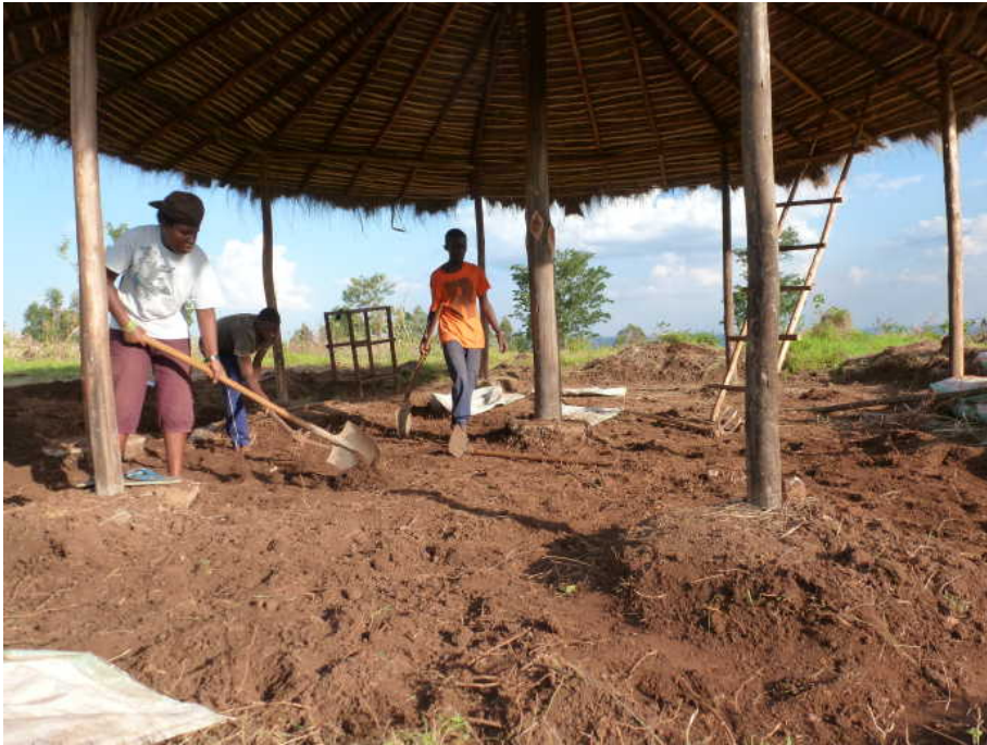
Digging to remove roots of grass and to make the floor level

The floor of the hut can be left as bare earth, gravel, or other. We decided to make a strong floor with rocks and cement so that it could last a long time. We also extended the floor outside the benches to protect the building from rain. This is not the only way to make a cement floor. Gravel can be used instead of big rocks as a base for the floor.