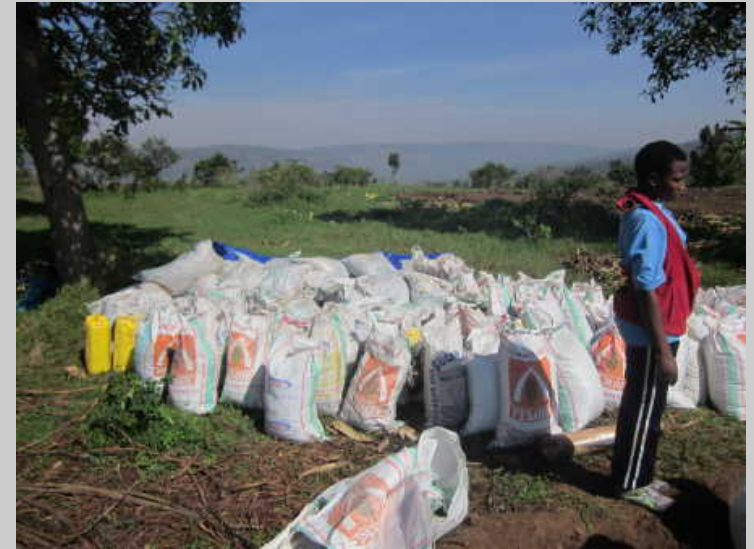
25 kg rice bags