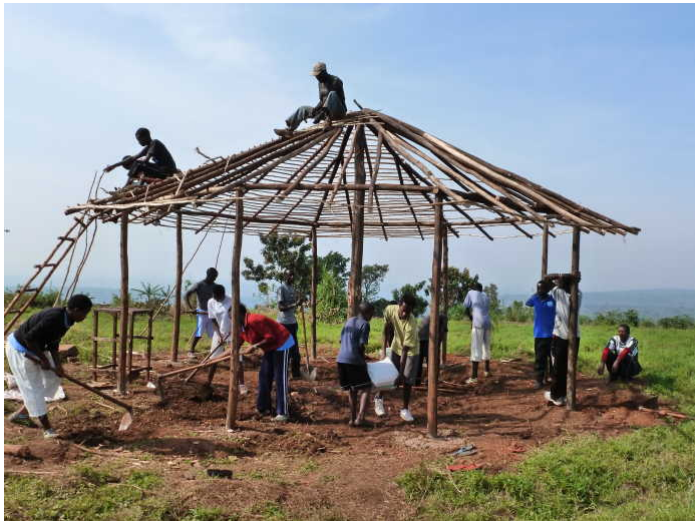
We learned that it is not a good idea to work below people who are using hammer and nails above.