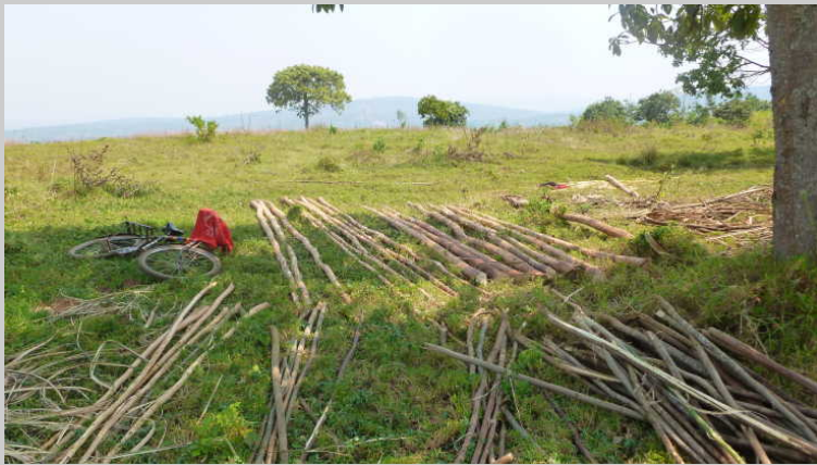
Cut eucalyptus trees with peeled bark