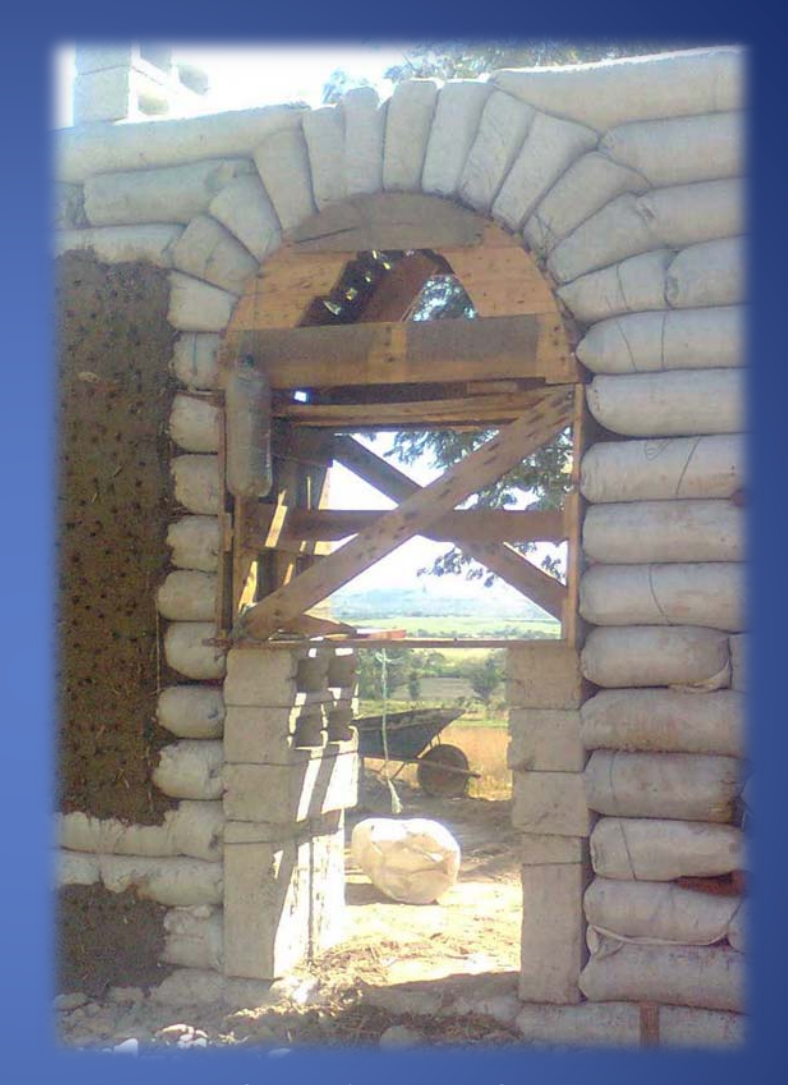
8. Have fun placing fan bags.