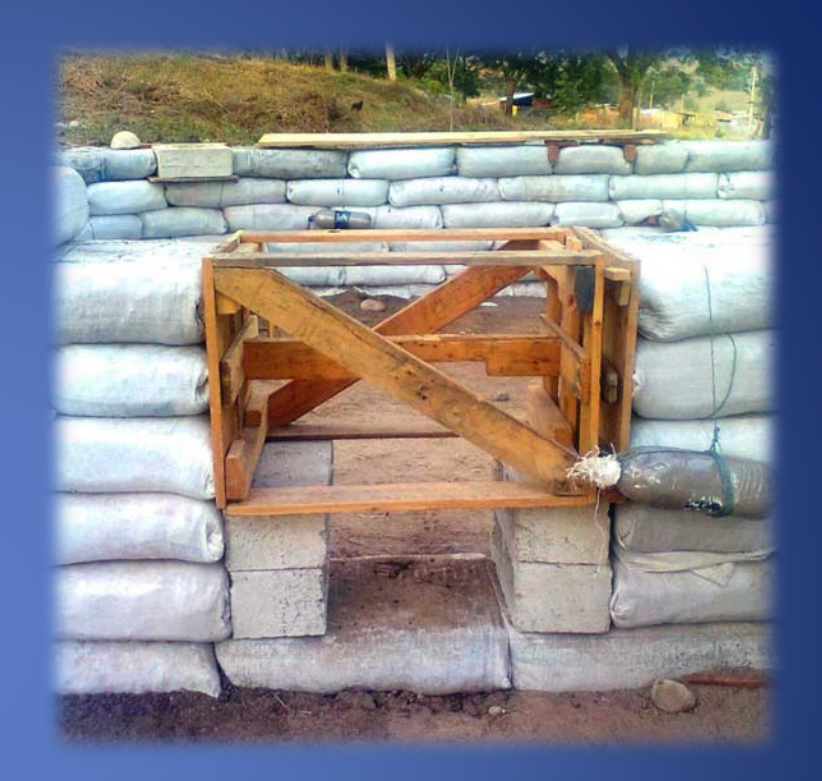
4. Our forms were 3 rows high. When we've reached that level, we would rise it using blocks underneath.

It took some time, but we save on materials.