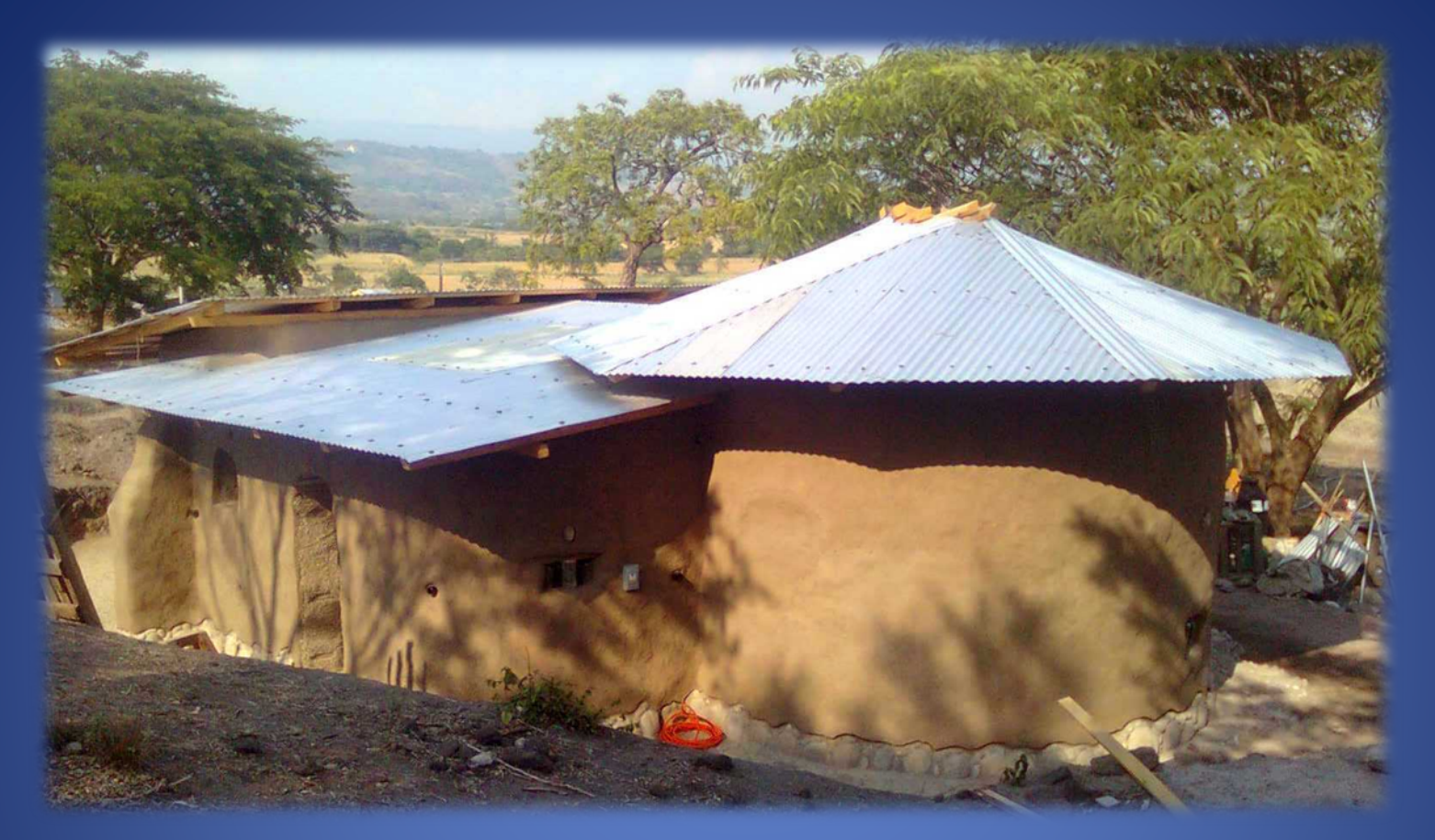
Now you can't !!

After we removed the arc forms, we screwed wood planks on the external side. Then we applied two coats of external plaster on the wall.