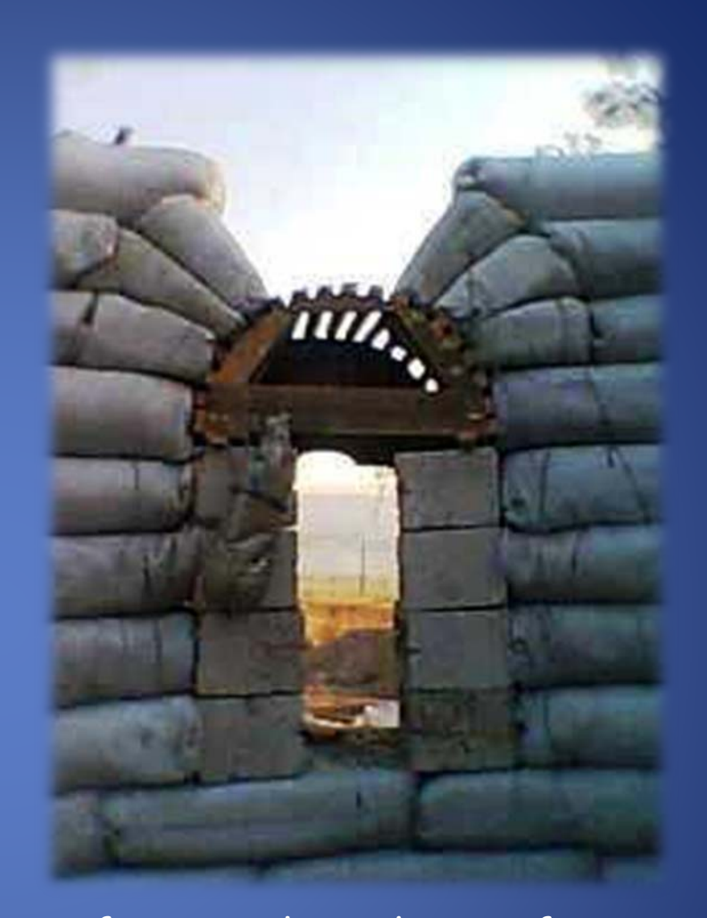
2. Before we place the arc form, we removed the center blocks so that it would be easier to un-locked the whole thing when ready.