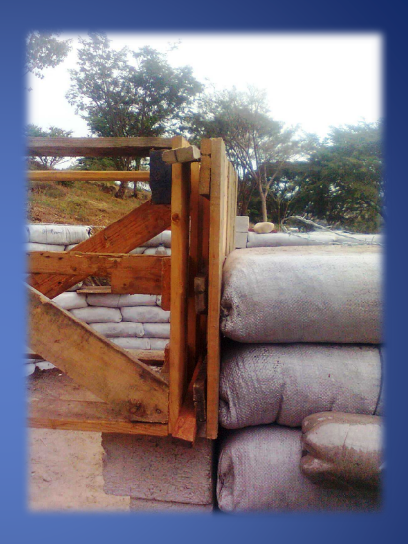
6. By that time, the bags were pretty firm. We always manage to stay "plumbed".