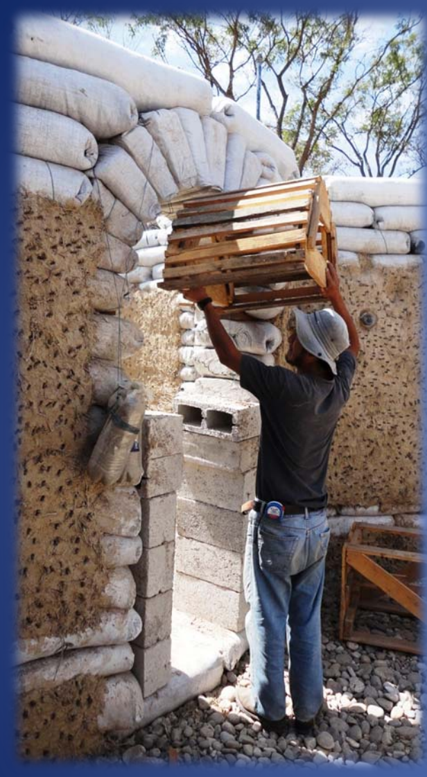
9. Remove the forms