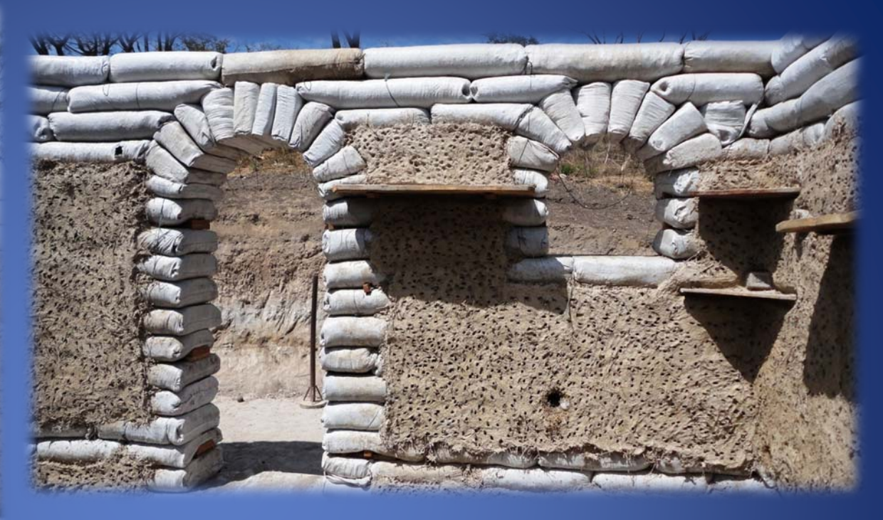
10. It was now easy to walk in or out !!