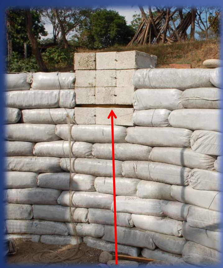
1. Not easy to see, but we used blocks as window forms.