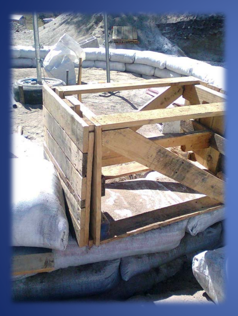
3. Place form at begging of door's gap