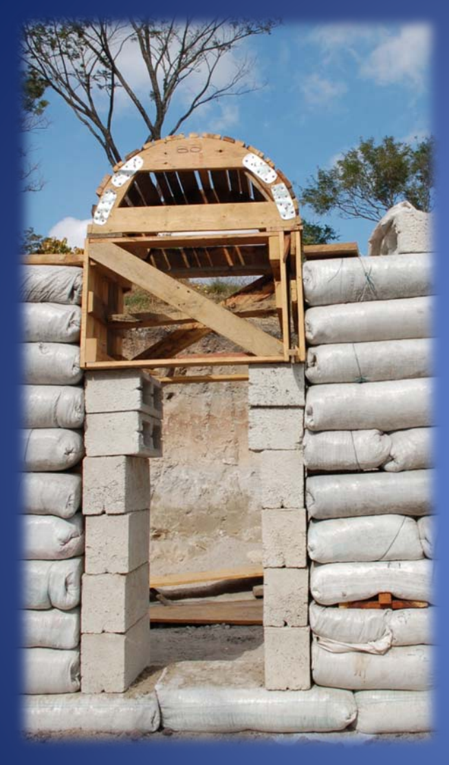
7. Place the arc form.