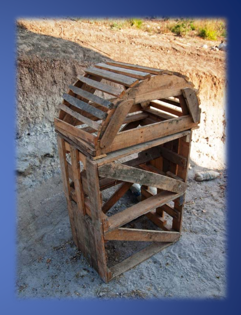
1 & 2. We used recycled pallets. Lots of work but we've got them almost for free