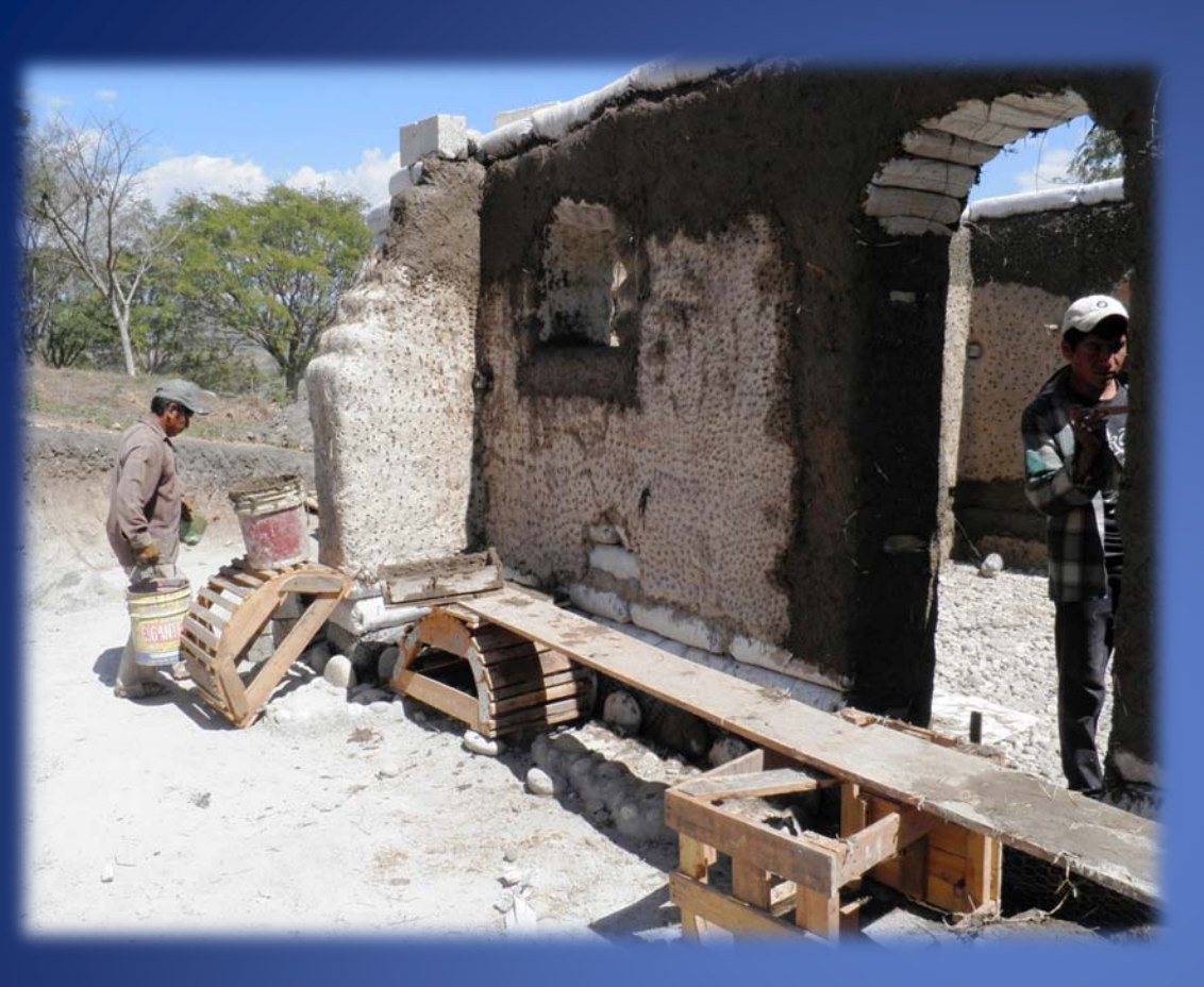
11. Forms as scaffoldings!!