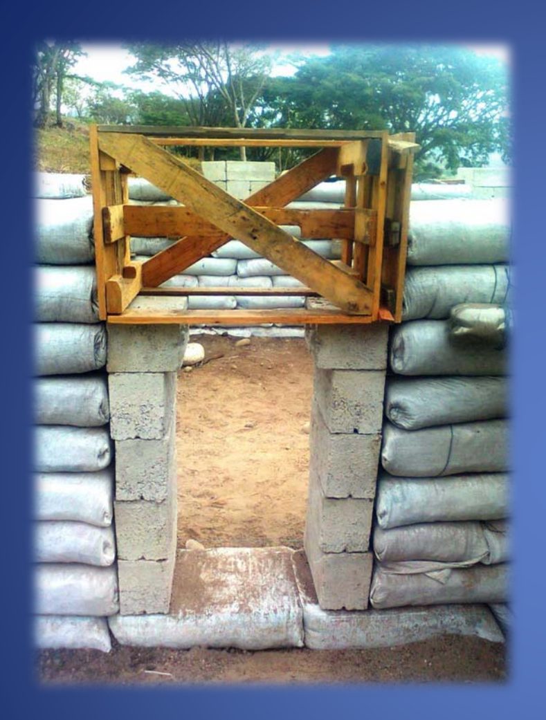
5. It would take 2-3 days until having to rise the form up.